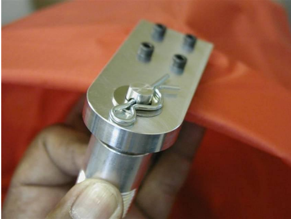
The top mount is threaded into a pole (not provided) with the pole passing through the rope loop and then attaching the top mount.